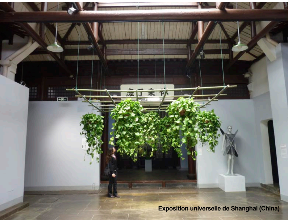
Exposition universelle de Shanghai (China)

Wikipedia : https://en.wikipedia.org/wiki/scenocosme