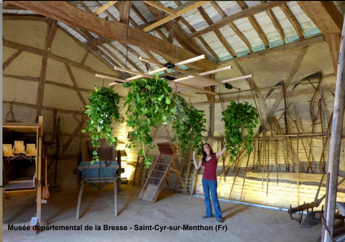
Musée départemental de la Bresse - Saint-Cyr-sur-Menthon (Fr)