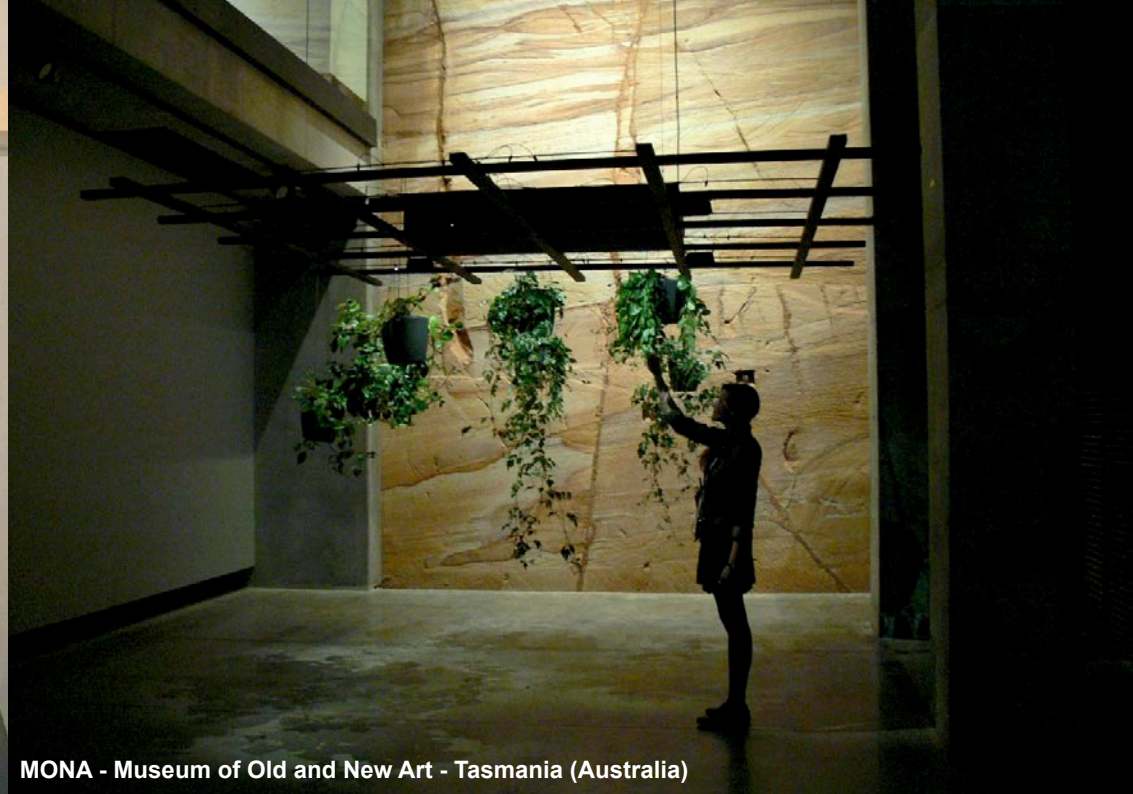
MONA - Museum of Old and New Art - Tasmania (Australia)