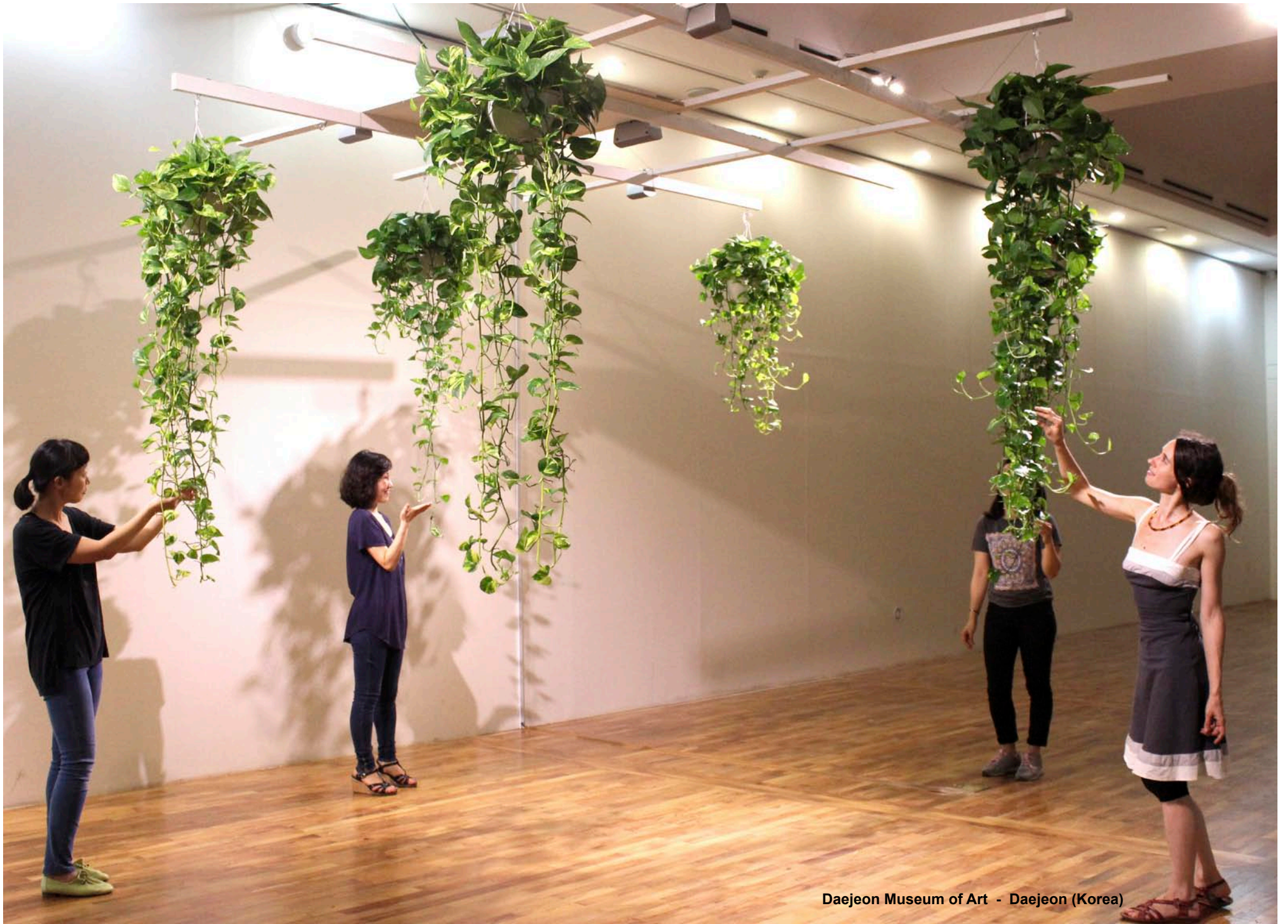
Daejeon Museum of Art - Daejeon (Korea)