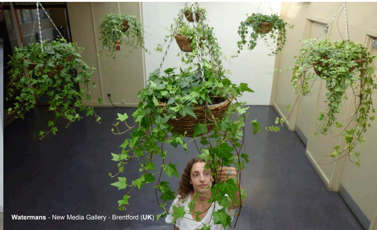
Watermans - New Media Gallery - Brentford (UK)