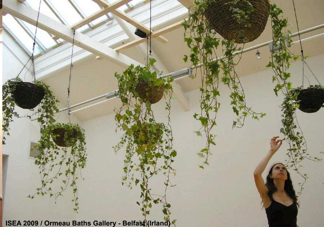
ISEA 2009 / Ormeau Baths Gallery - Belfast (Ireland)