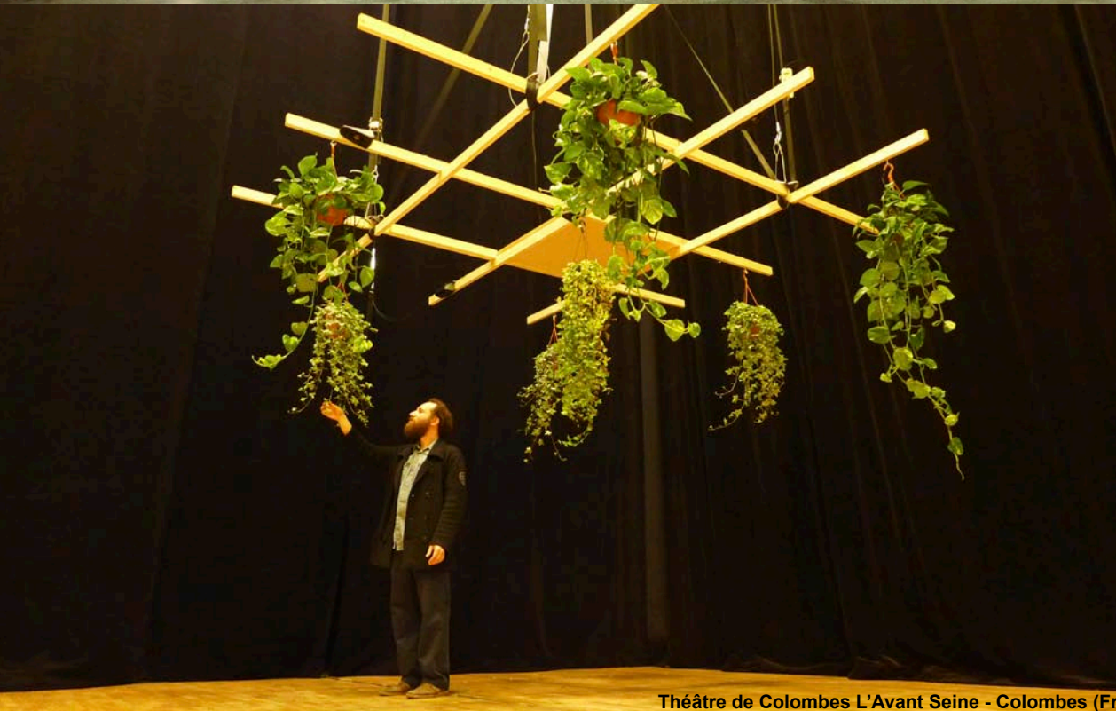
Théâtre de Colombes L'Avant Seine - Colombes (Fr)