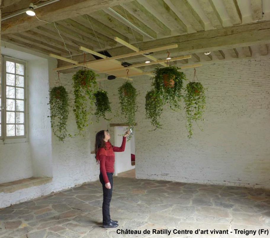
Château de Ratilly Centre d'art vivant - Treigny (Fr)