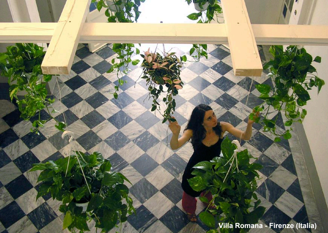
Villa Romana - Firenze (Italia)