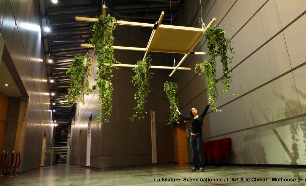
La Filature, Scène nationale / L'Art & le Climat - Mulhouse (Fr)