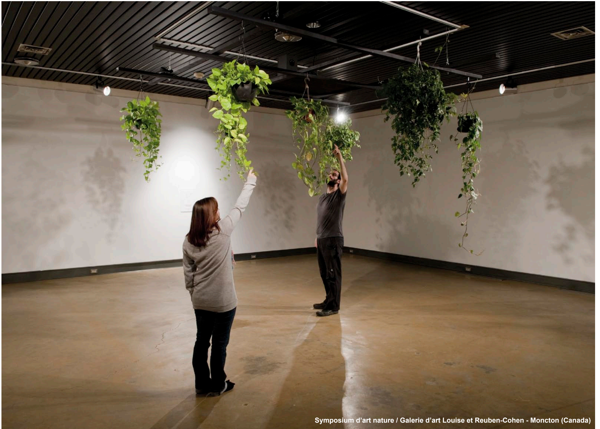
Symposium d'art nature / Galerie d'art Louise et Reuben-Cohen - Moncton (Canada)