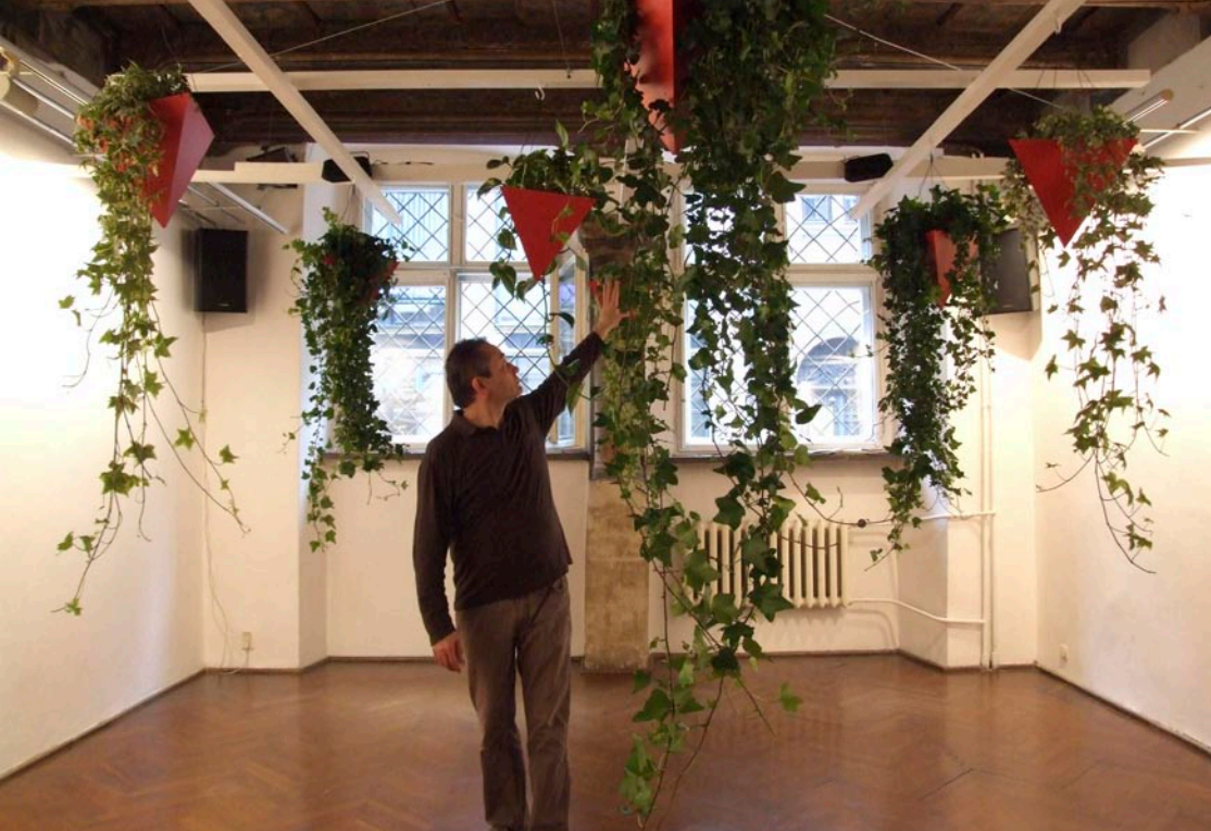
WRO 09 - 13th Media Art Biennale / Entropia Gallery - Wroclaw (Poland)