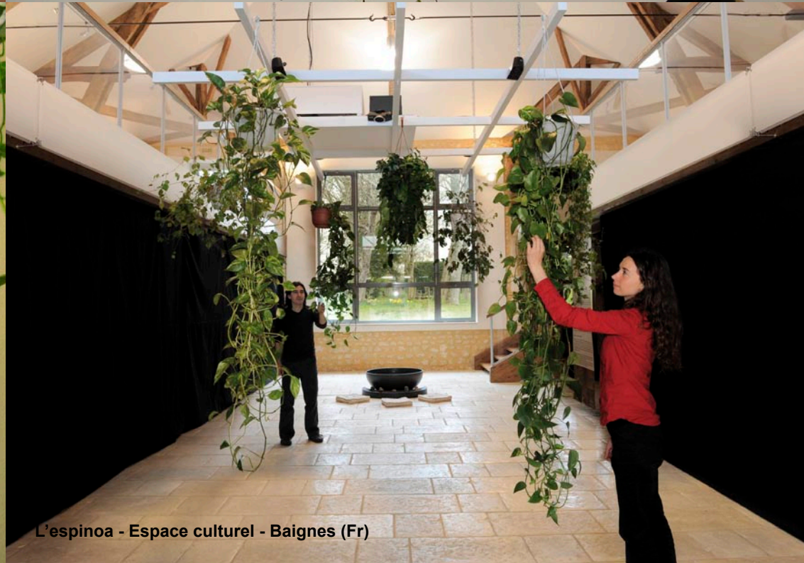
L'espinoa - Espace culturel - Baignes (Fr)