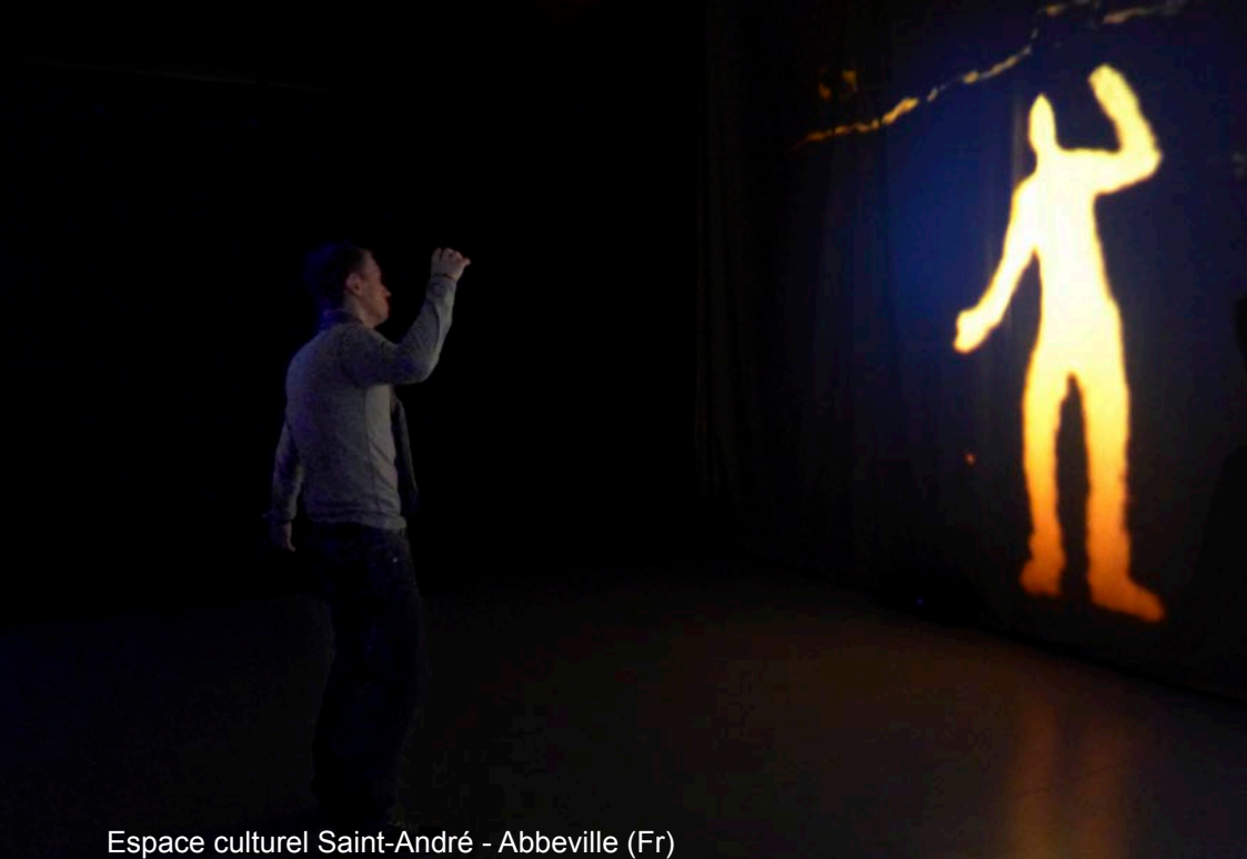
Espace culturel Saint-André - Abbeville (Fr)