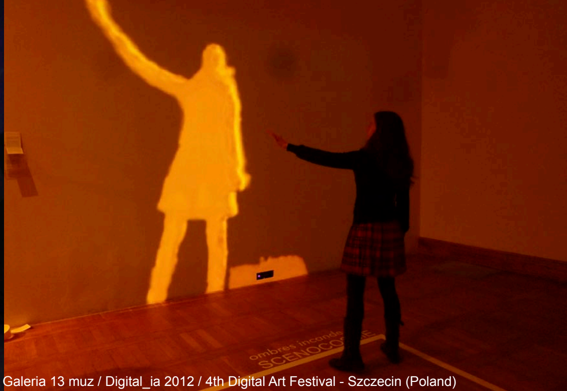
Galeria 13 muz / Digital_ia 2012 / 4th Digital Art Festival - Szczecin (Poland)