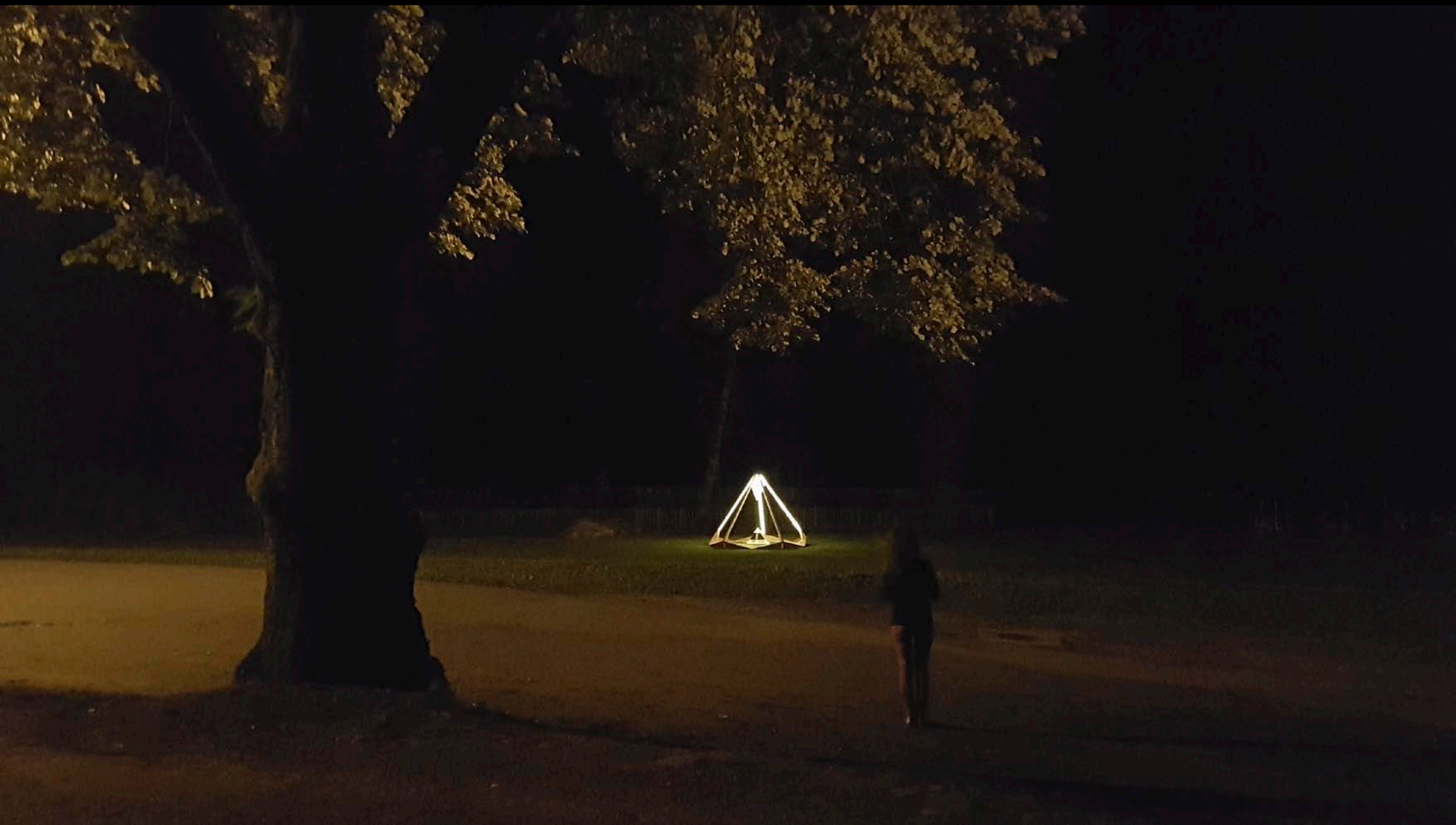
Art Contemporain in situ / Parc thermal - Saint-Gervais-les-Bains (fr) Programmation d'Archipel Art Contemporain / Chemins de la Culture «Plein Air. Parcours d'art à ciel ouvert»